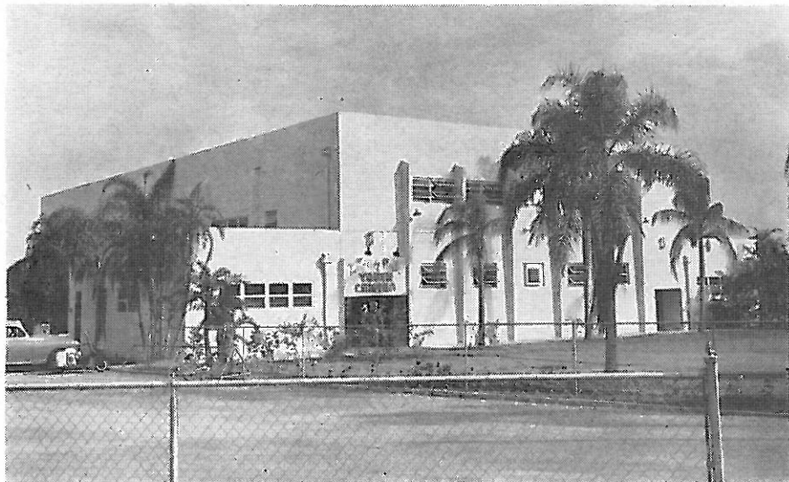
YOUNGER SET'S DELIGHT is St. Petersburg's Bartlett Park Youth Center. This popular recreation center was opened in December 1951 and besides being the focal point of the City Recreation Department's youth work, it is also the site of many high school basketball games, holiday programs, dances and variety shows.