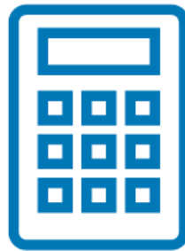
Destinations International – Event Impact Calculator