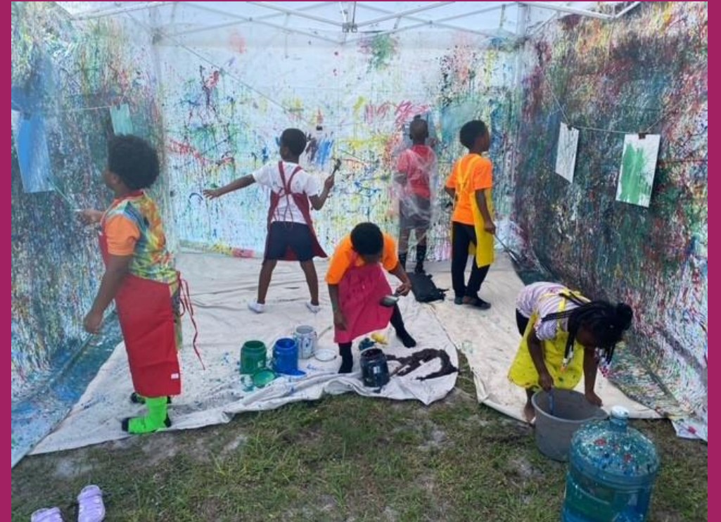
East Stuart Youth Initiative at the 10 th Street Community Center, Stuart Florida