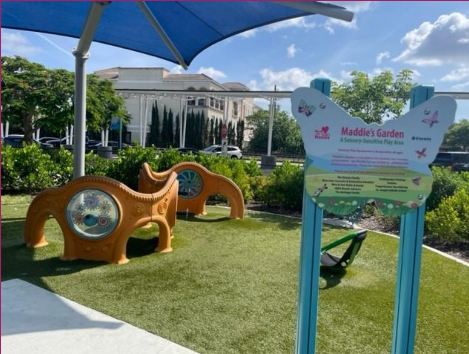
Sensory Sensitive Play Area